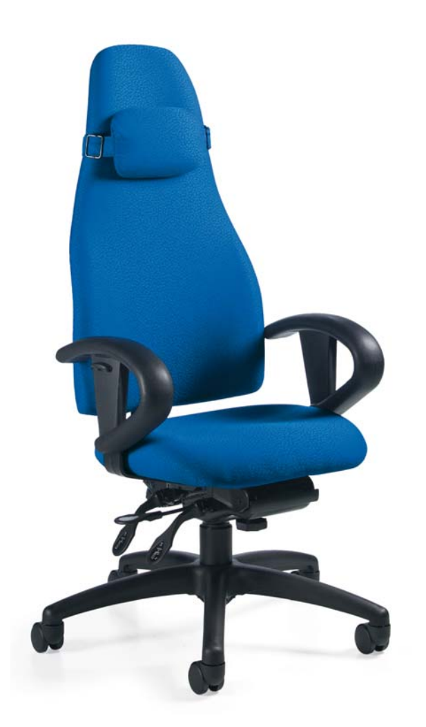
4470 High Back Knee-Tilter with optional 9S arm